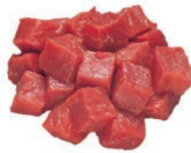
Cubed Goat, Boneless