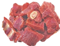
Diced Goat, Bone In