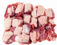
Skin On Goat Cubes